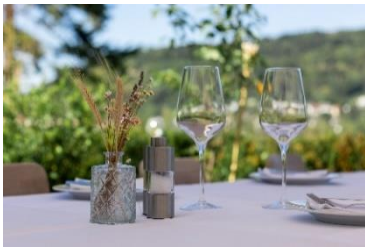
standard decoration in the Waldhaus (candles, standard table flowers)