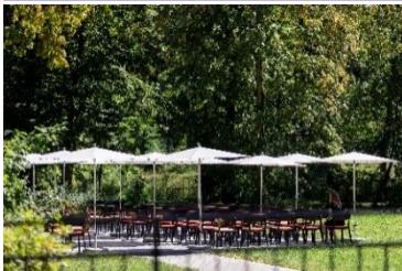
wedding ceremony on the Kobel