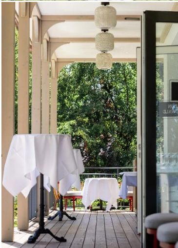
aperitif on the Veranda